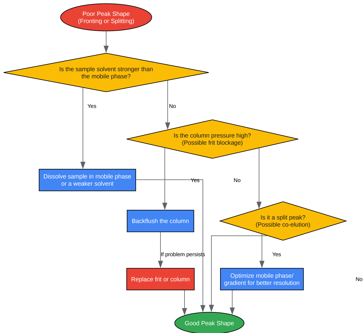
Caption: Troubleshooting workflow for peak tailing.

Click to download full resolution via product page