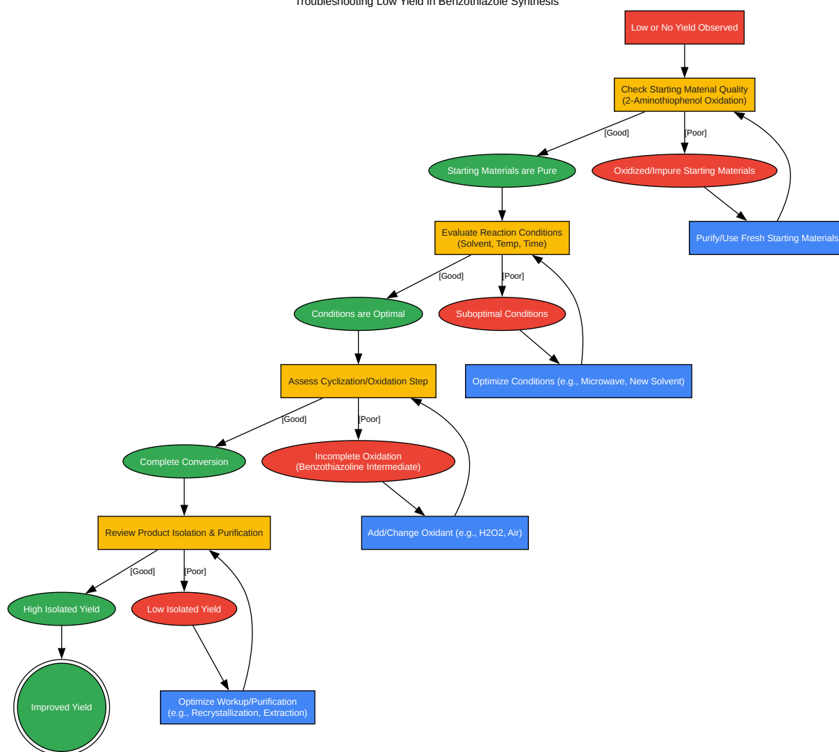
Troubleshooting Low Yield in Benzothiazole Synthesis

Click to download full resolution via product page