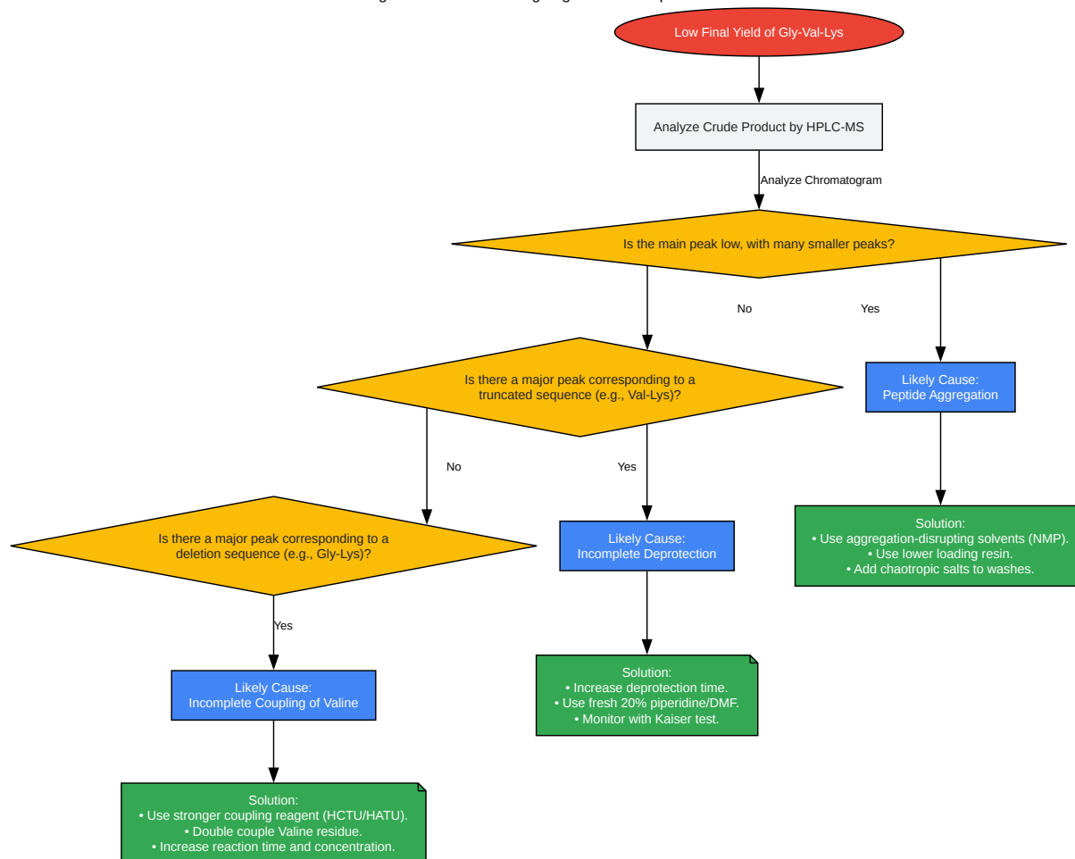
Figure 2. Troubleshooting Logic for Low Peptide Yield

Click to download full resolution via product page