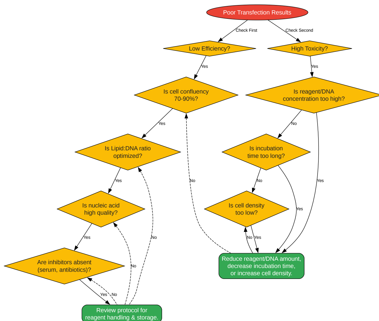
Caption: General workflow for a cationic lipid transfection experiment.

Click to download full resolution via product page