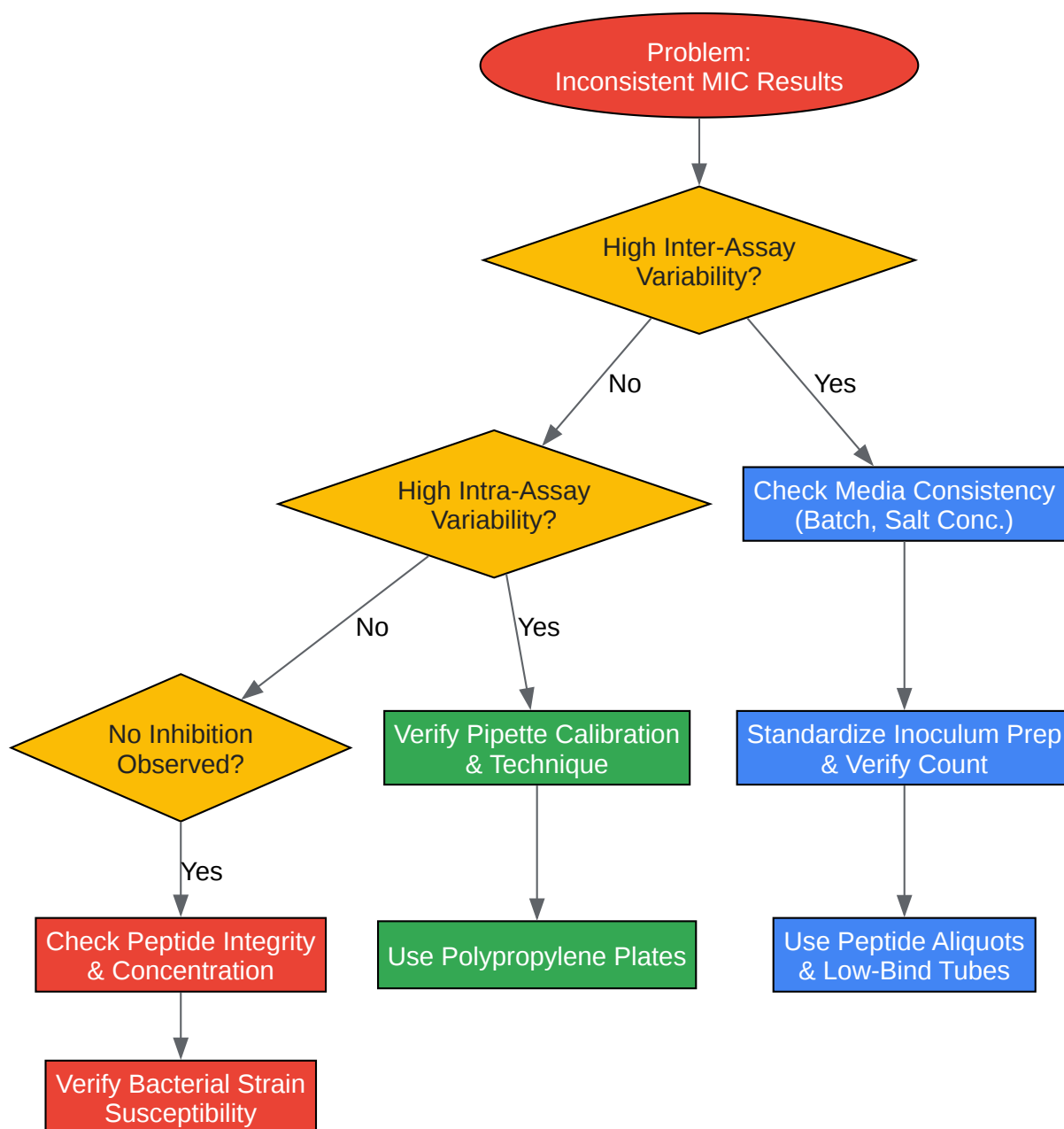
Figure 2. Troubleshooting MIC Assay Variability

Click to download full resolution via product page