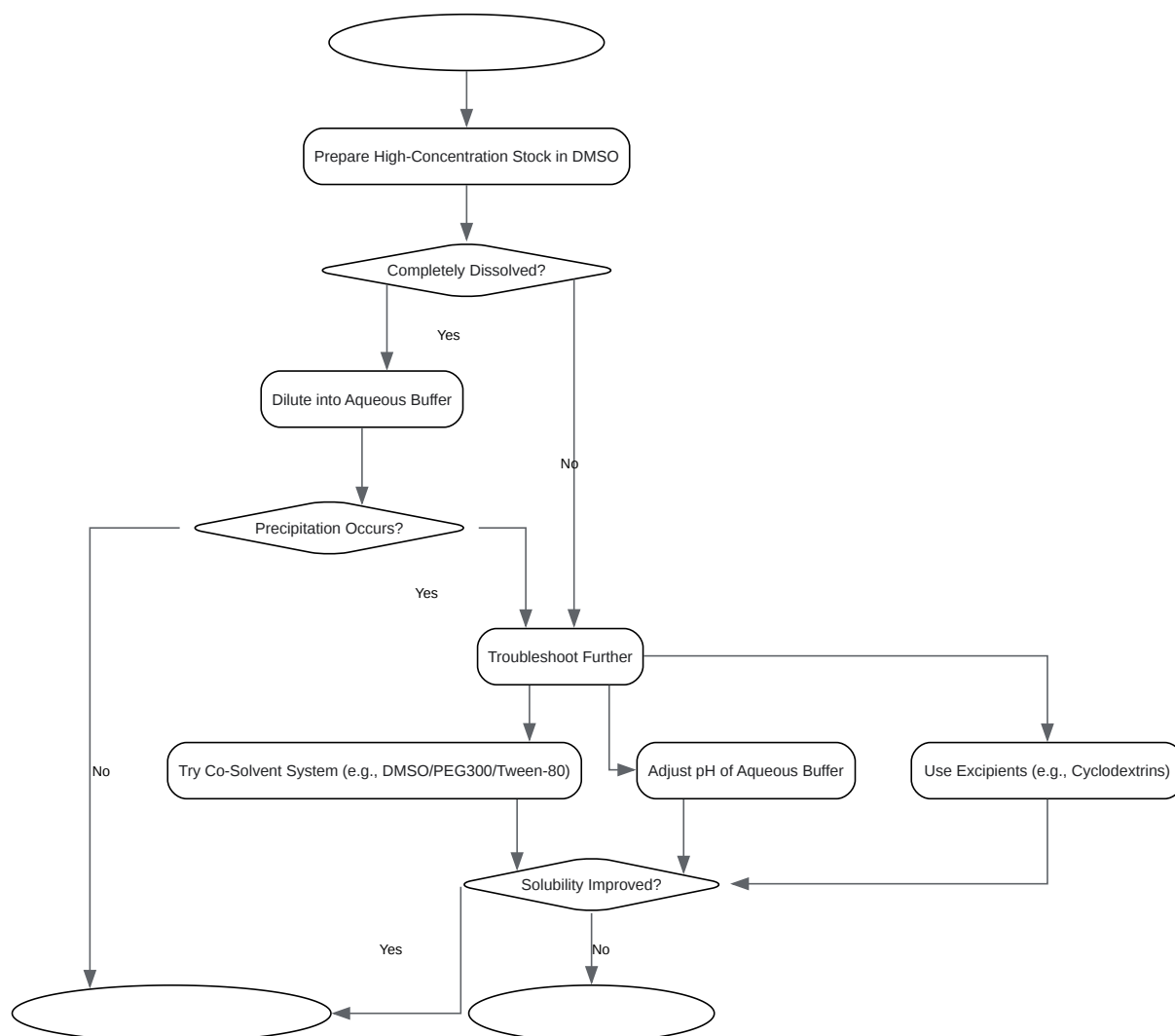
Diagram 1: Troubleshooting Workflow for BPK-25 Solubility Issues

Click to download full resolution via product page