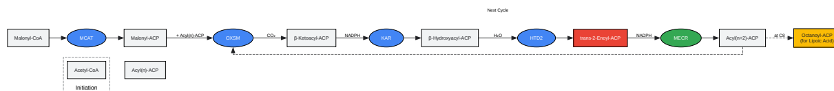
Figure 1. The Mitochondrial Fatty Acid Synthesis (mtFAS) Cycle

The trans-2-enoyl-ACP is the pivotal intermediate linking the dehydration and final reduction steps of the cycle. Its efficient conversion to a saturated acyl-ACP by MECR is essential for the continuation of the mtFAS pathway. [8][10]