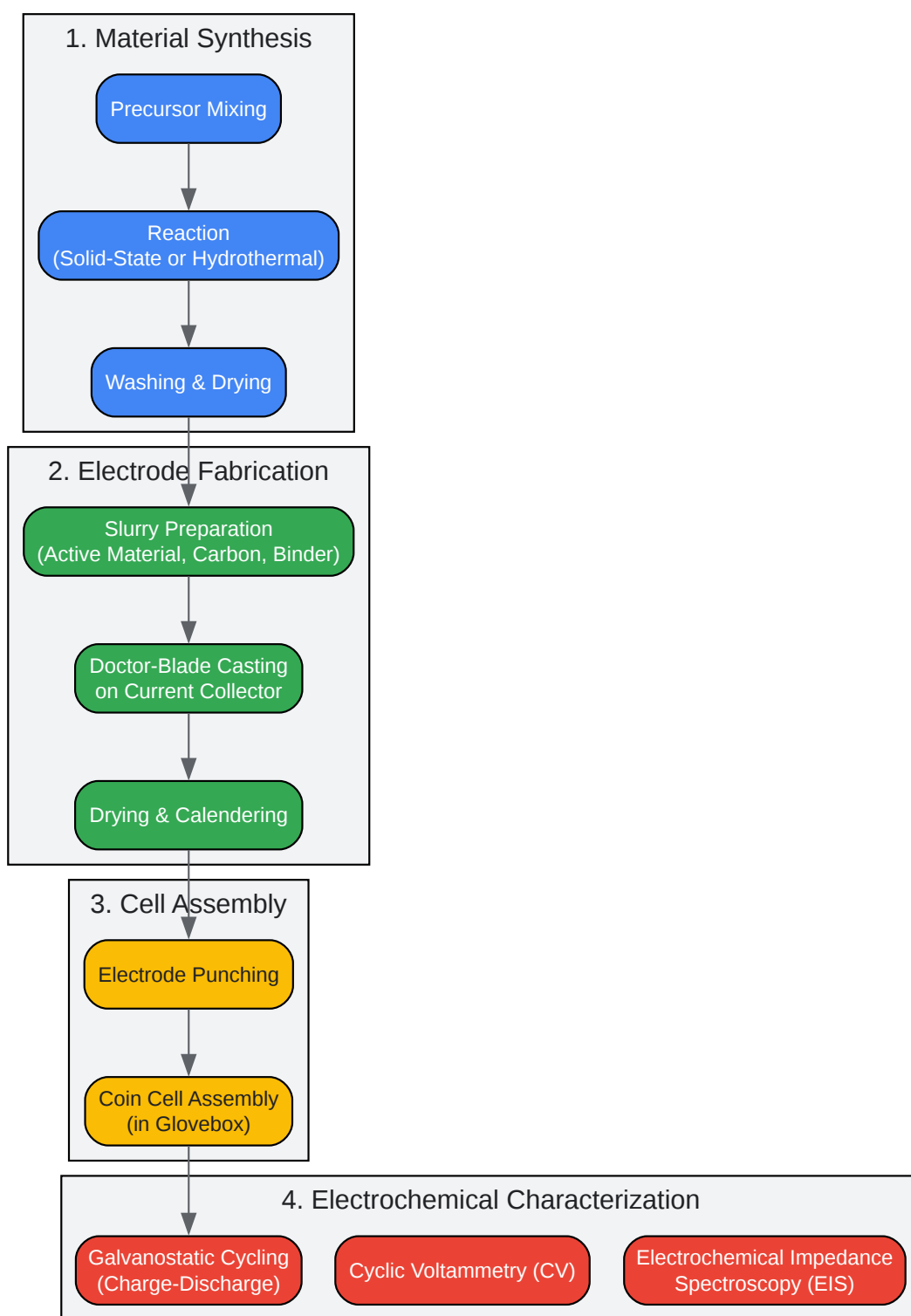
General Experimental Workflow for Battery Testing

Click to download full resolution via product page