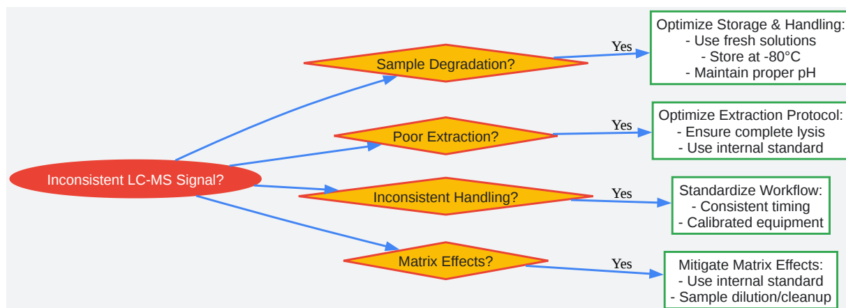
Caption: Workflow for assessing the stability of 2-hydroxycerotoyl-CoA .

Click to download full resolution via product page