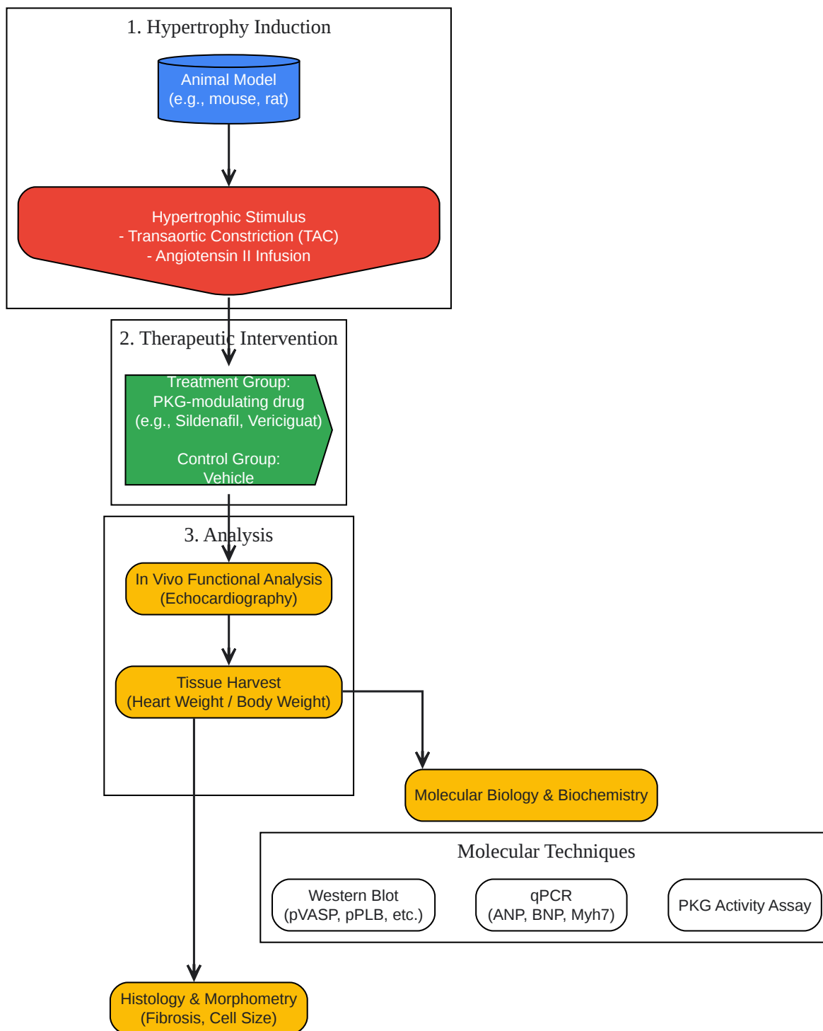
General Experimental Workflow for Studying PKG in Cardiac Hypertrophy

Click to download full resolution via product page