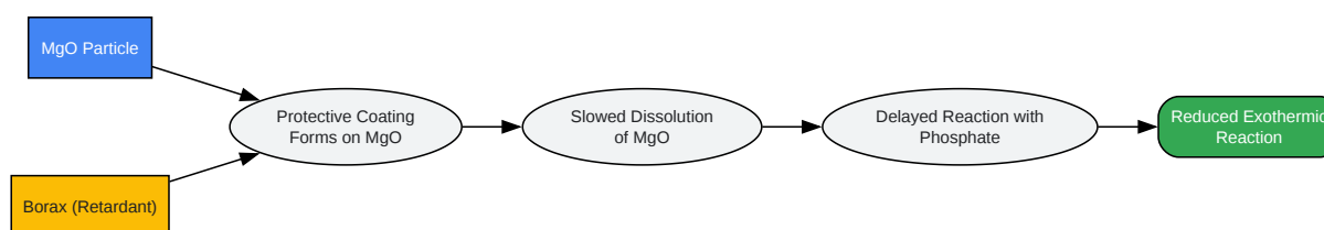
Caption: Basic setting reaction of Magnesium Potassium Phosphate Cement.

Click to download full resolution via product page