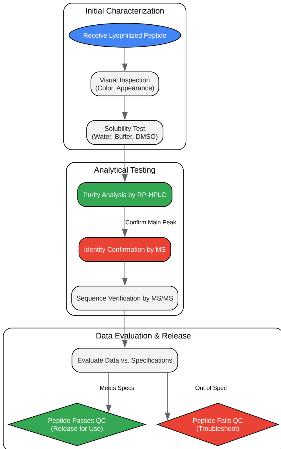
H-Met-Thr-OH Quality Control Workflow

Click to download full resolution via product page