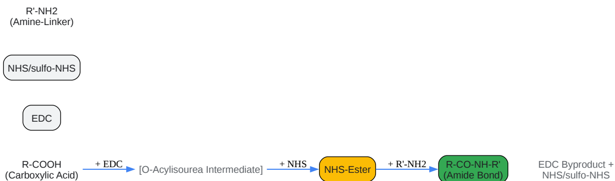
Figure 1: General experimental workflow for the EDC/NHS mediated coupling of an amine-linker to a carboxylic acid-containing target ligand.

Click to download full resolution via product page