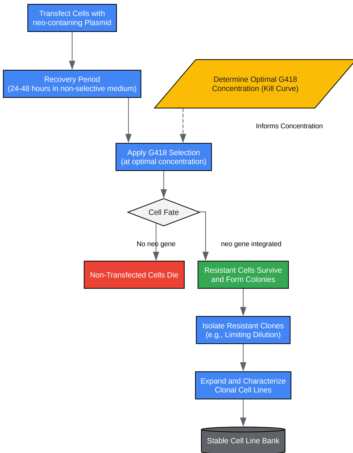
G418 Stable Cell Line Generation Workflow

Click to download full resolution via product page