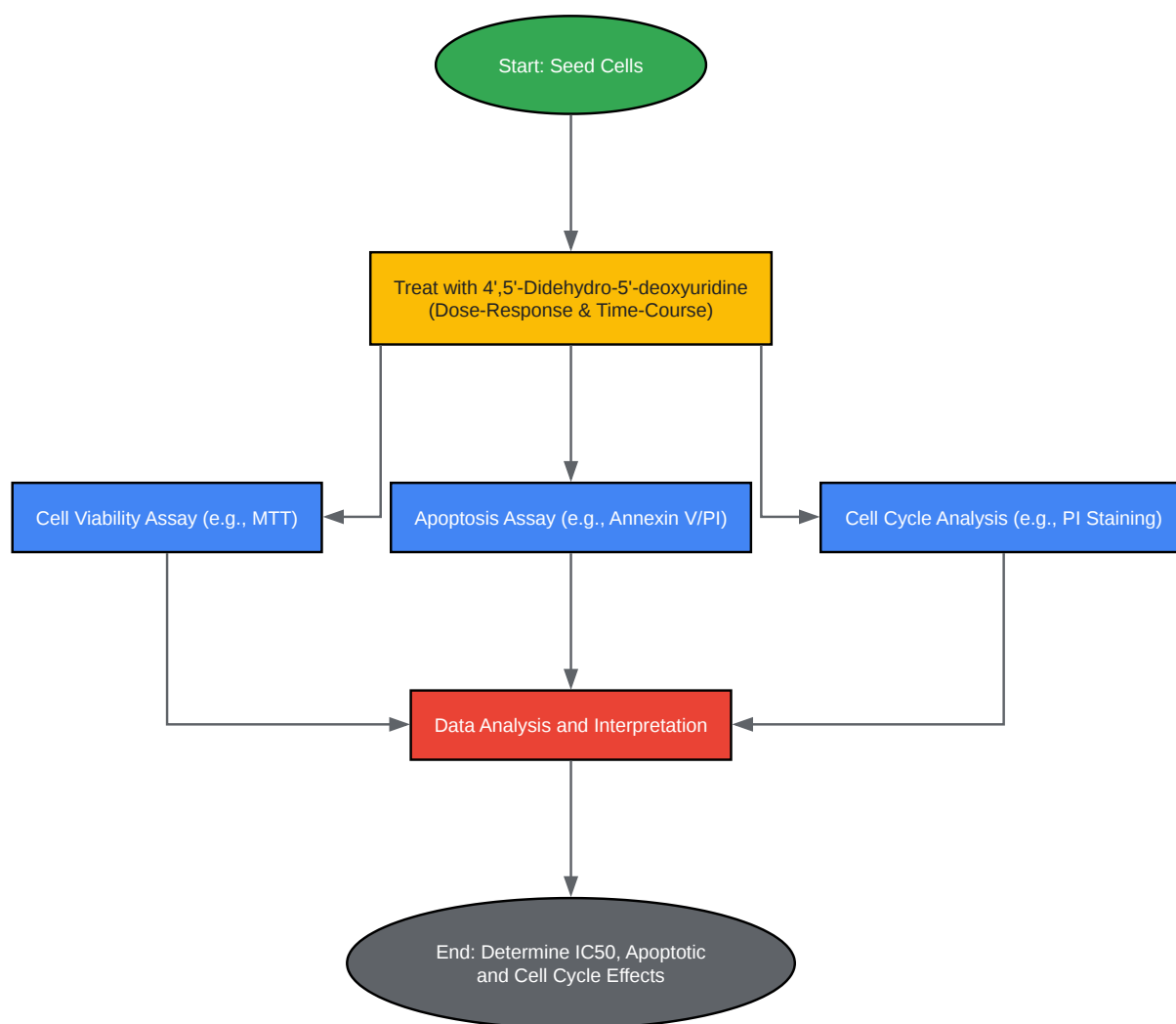
Diagram 2: Experimental Workflow for Assessing Cytotoxicity