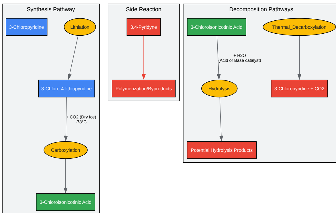
Synthesis and Decomposition of 3-Chloroisonicotinic Acid