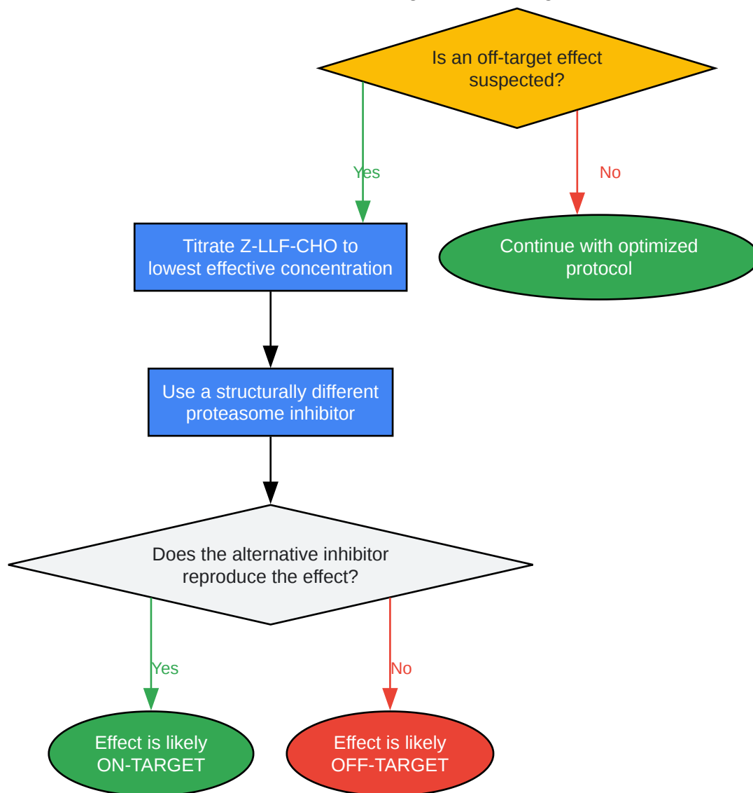
Decision Tree for Off-Target Effect Mitigation

Click to download full resolution via product page