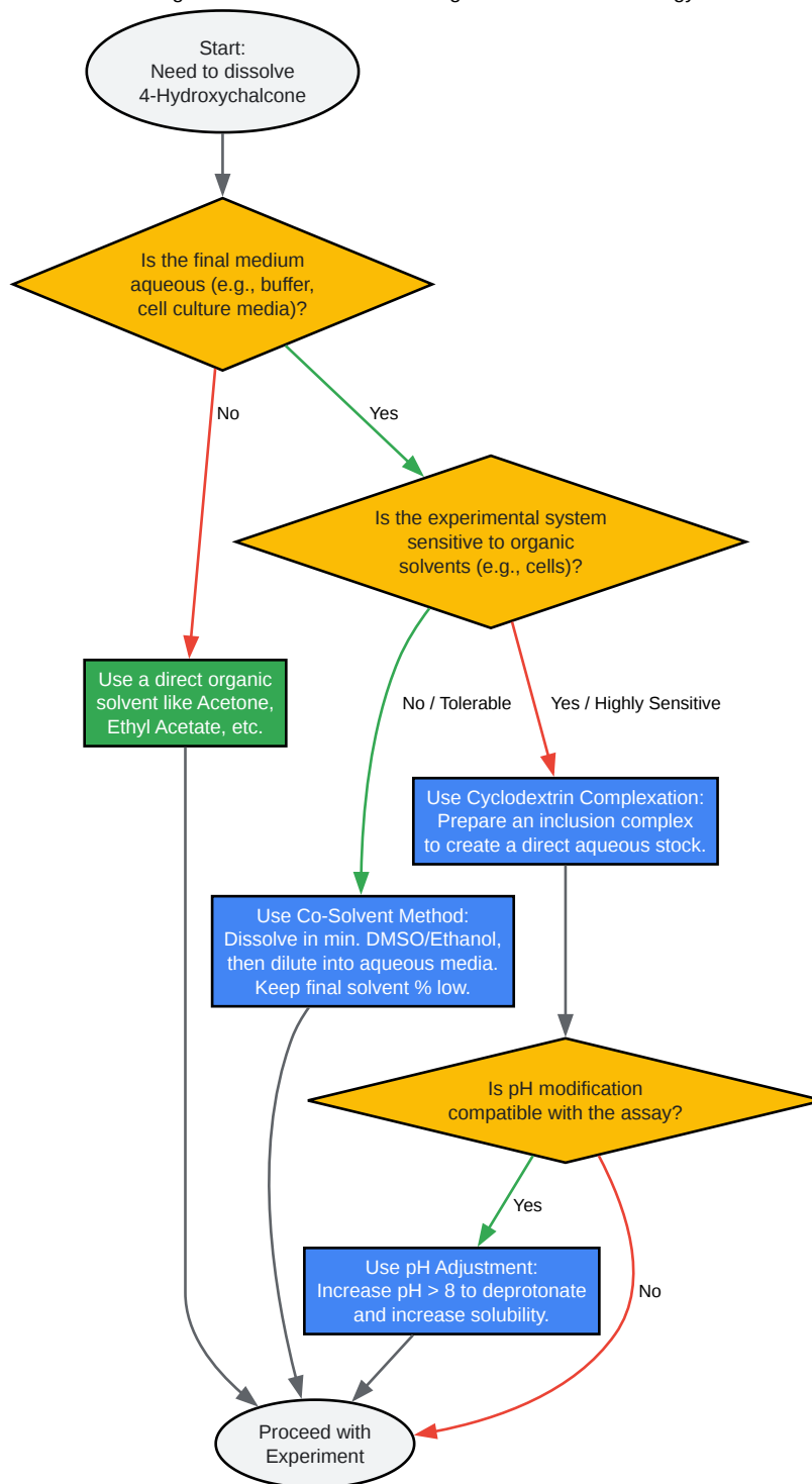
Diagram 1: Workflow for Selecting a Solubilization Strategy

Click to download full resolution via product page