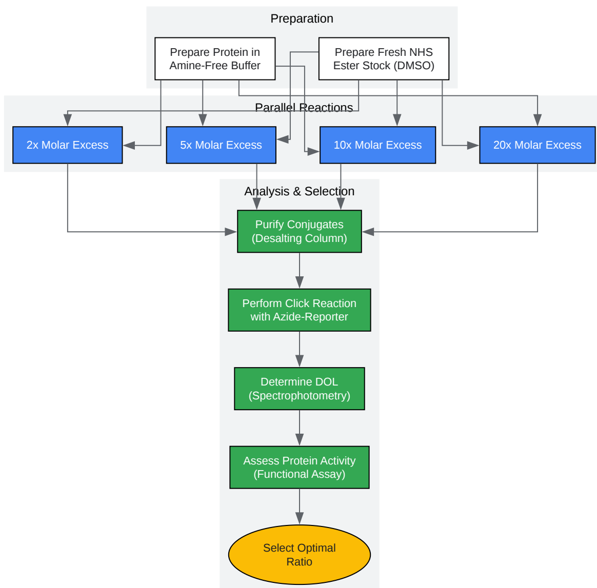
Figure 1. Workflow for Optimizing Molar Excess

Click to download full resolution via product page