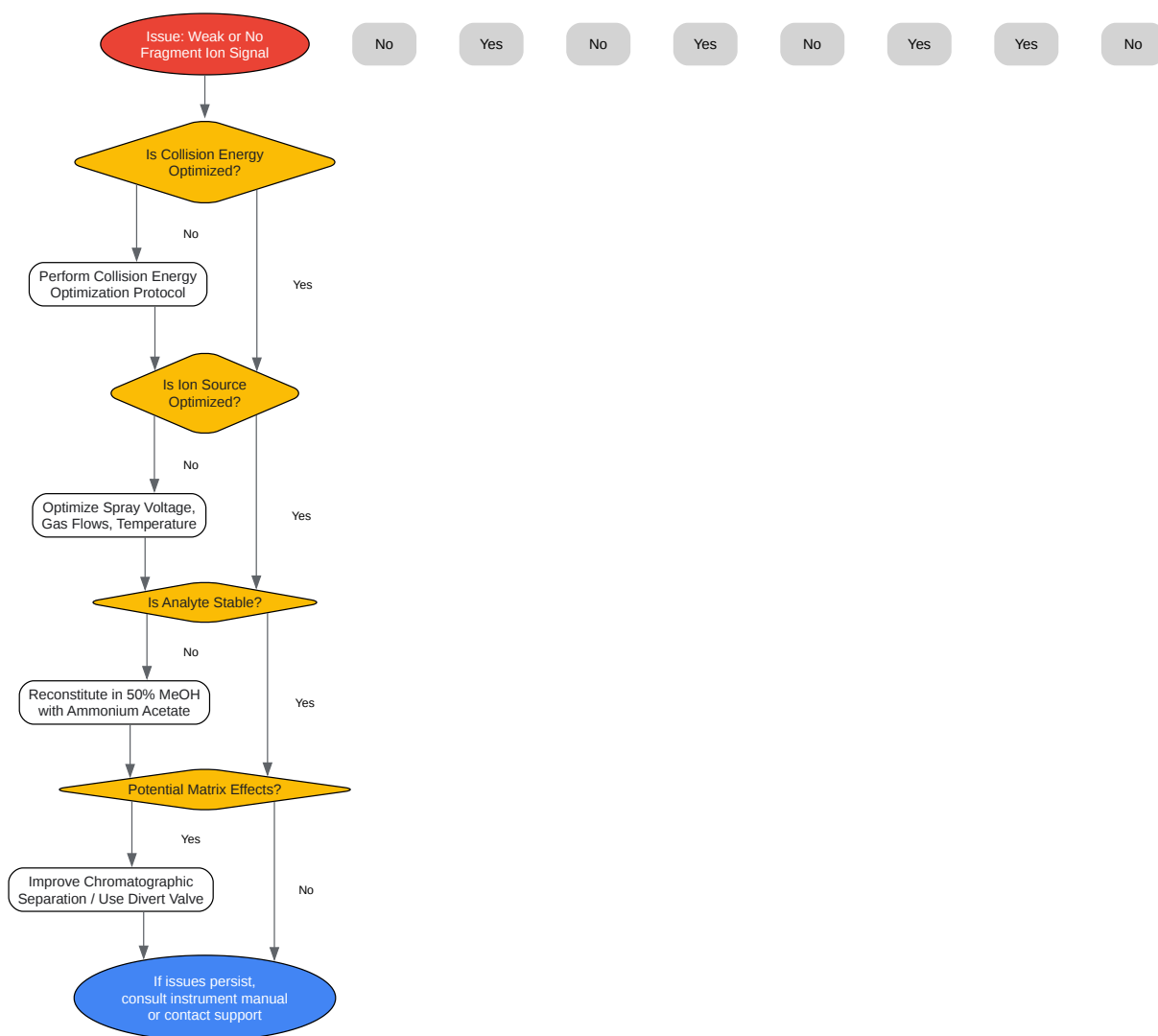
Caption: Workflow for Collision Energy Optimization.

Click to download full resolution via product page