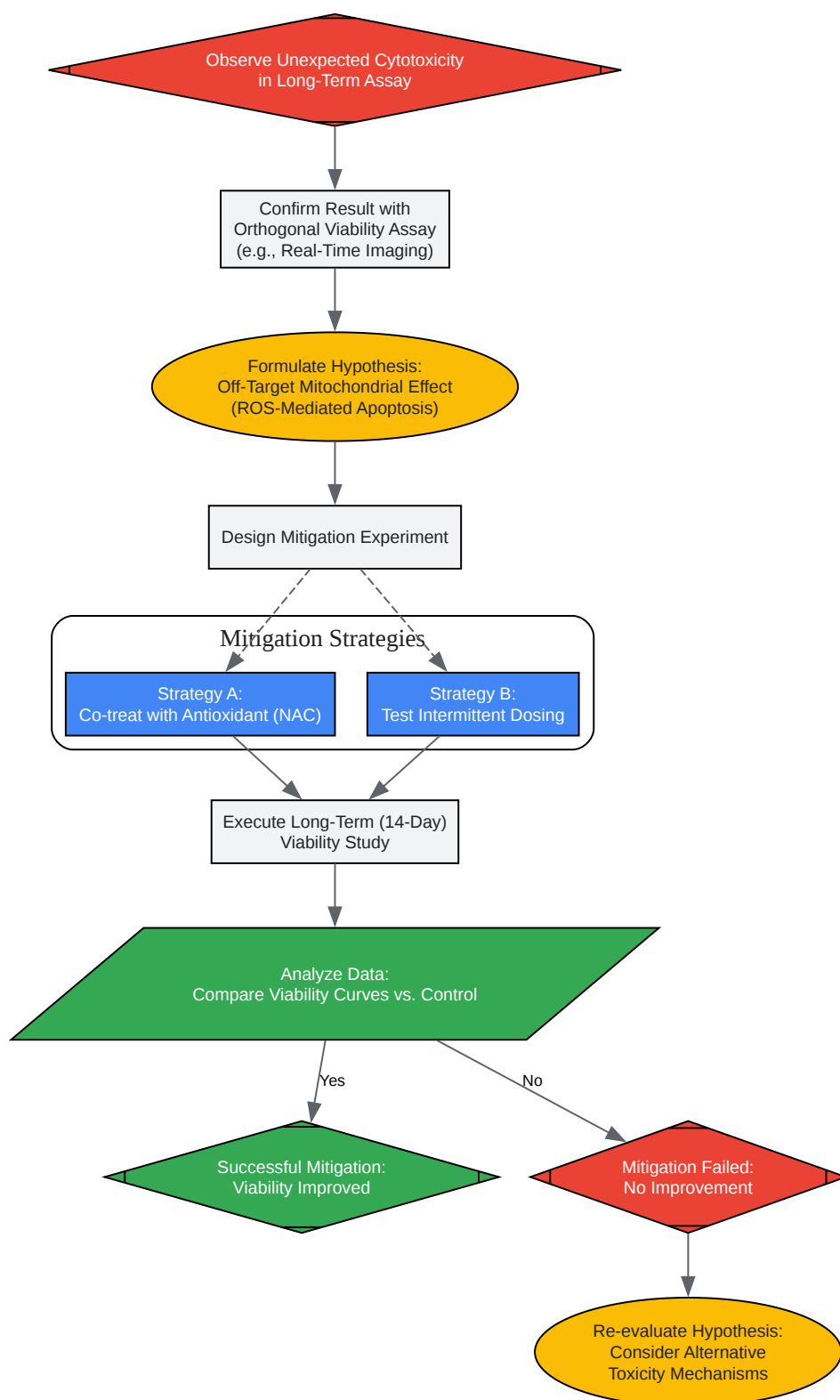
Experimental Workflow for Cytotoxicity Mitigation