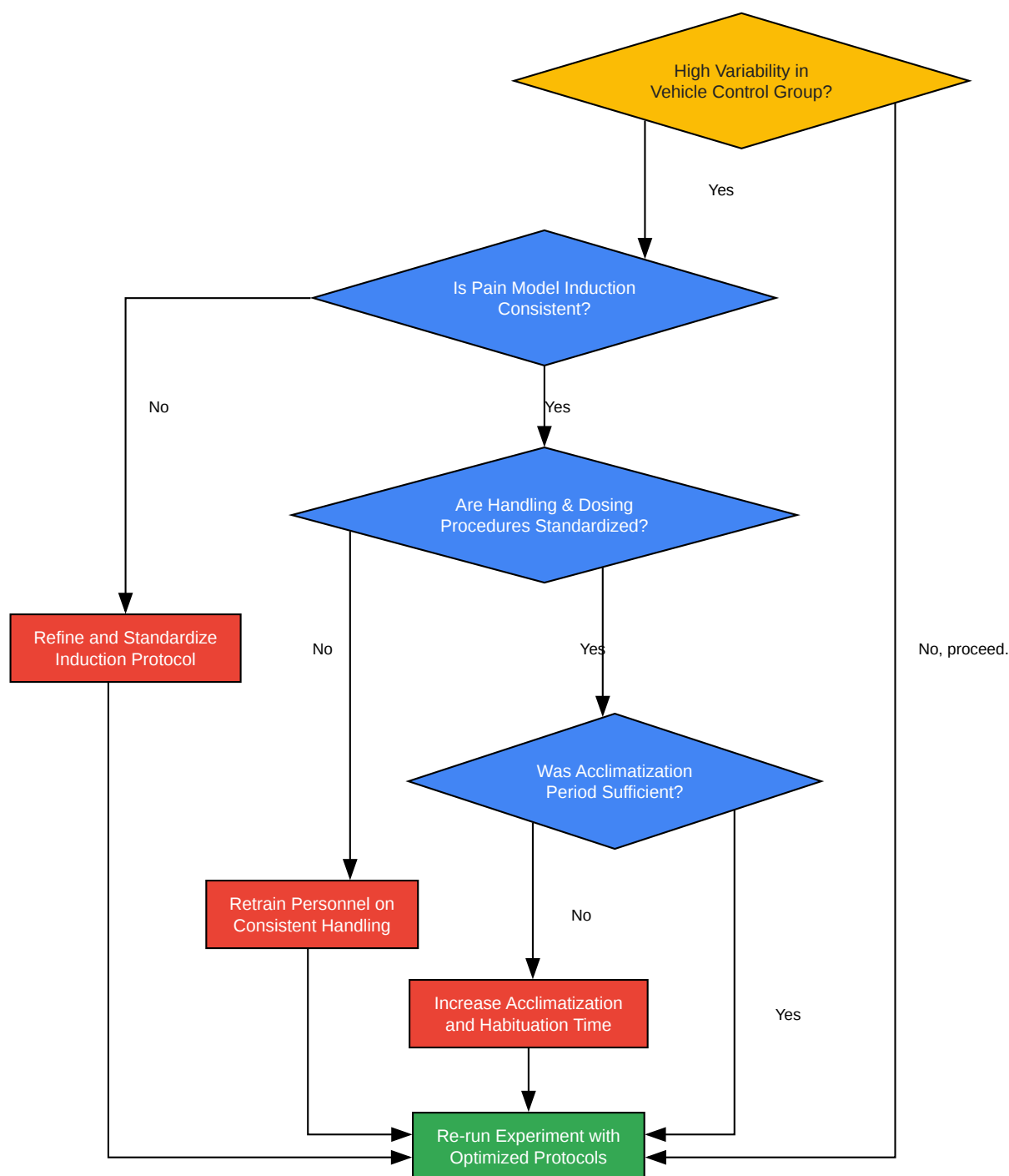
Diagram: Decision Tree for Troubleshooting High Variability