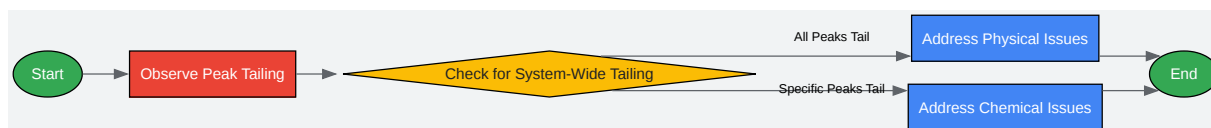
Caption: Causes of Peak Tailing in C18 Chromatography.

Click to download full resolution via product page