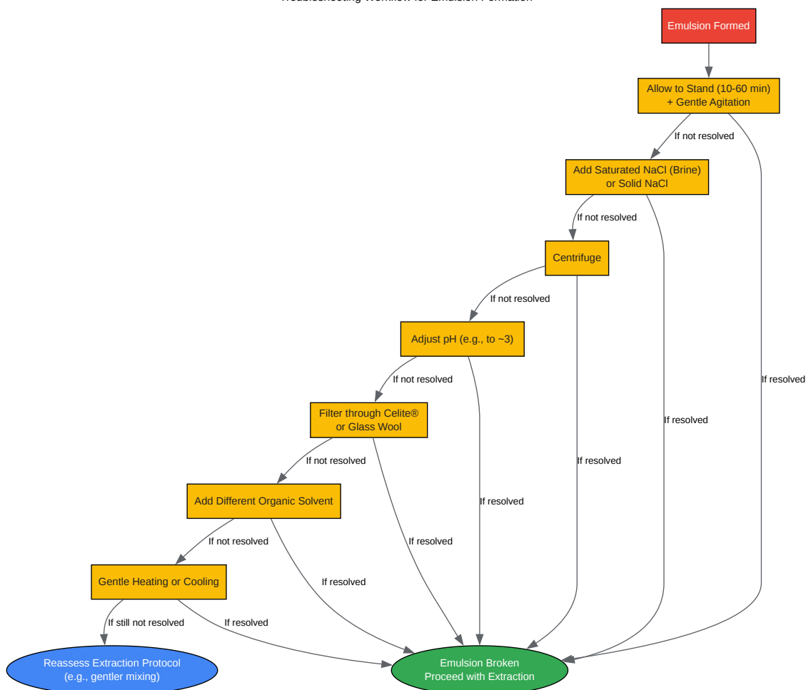
Troubleshooting Workflow for Emulsion Formation