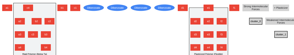
Figure 2. Mechanism of Plasticization

This molecular-level change manifests as a decrease in the material's glass transition temperature ( T_g ). Below its T_g , a polymer is hard and glassy; above it, the polymer is in a softer, rubbery state. [5] By lowering the T_g , dibenzoates effectively increase the flexibility and reduce the brittleness of the polymer at its service temperature. [13] The high solvating nature of dibenzoates means they are highly compatible with polar polymers like PVC and acrylics, leading to efficient plasticization. [8]