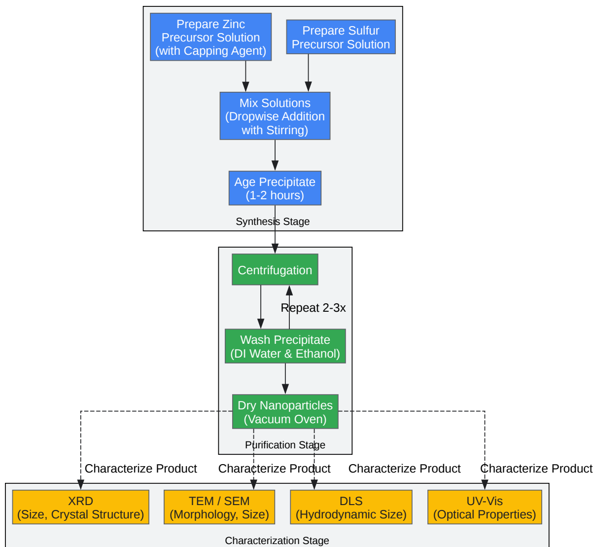
Diagram 1: Experimental Workflow for ZnS Nanoparticle Synthesis and Characterization

Click to download full resolution via product page