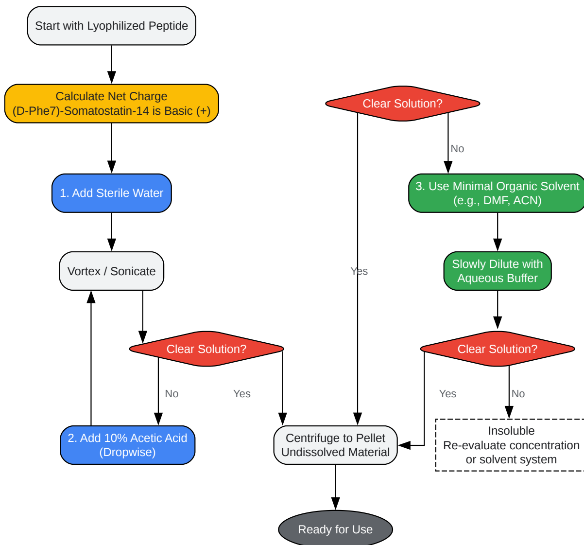
Diagram 1: Solubility Troubleshooting Workflow

Click to download full resolution via product page