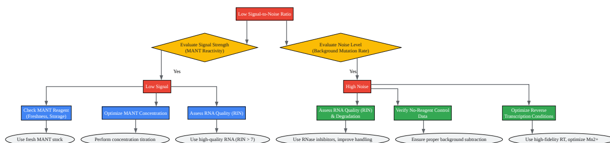
Diagram 2: Troubleshooting Logic for Low Signal-to-Noise Ratio

Click to download full resolution via product page