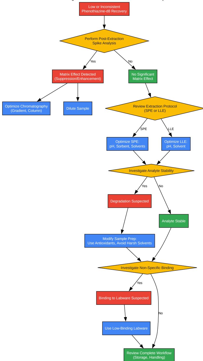
Troubleshooting Workflow for Low Phenothiazine-d8 Recovery