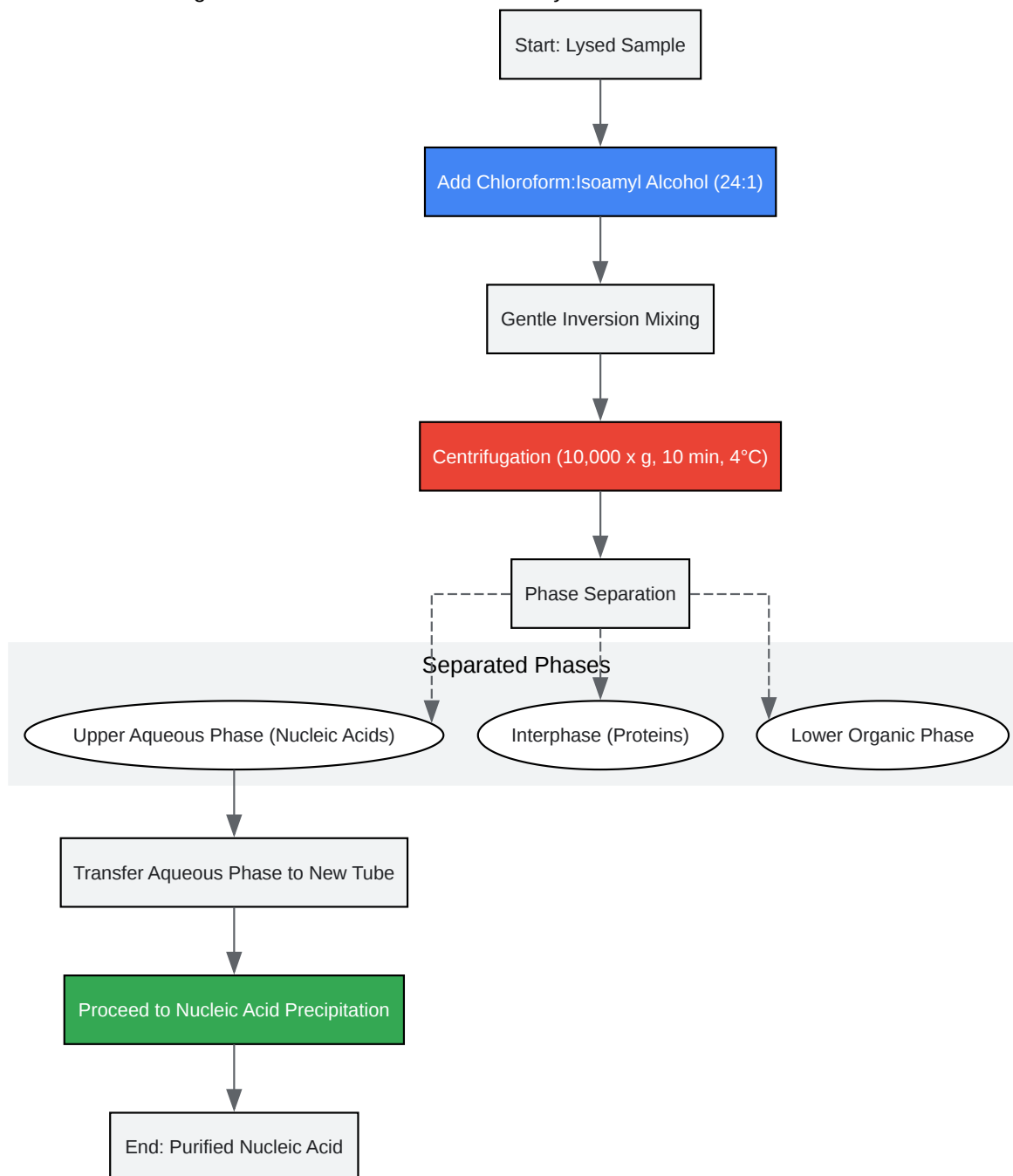
Figure 1: Standard Chloroform-Isoamyl Alcohol Extraction Workflow