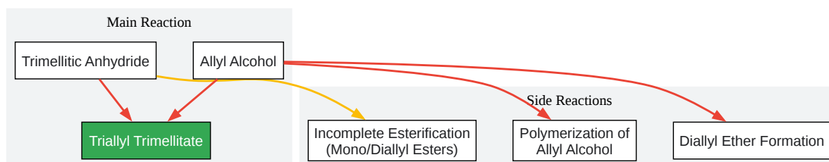
Caption: Main reaction pathway for triallyl trimellitate synthesis.

Click to download full resolution via product page