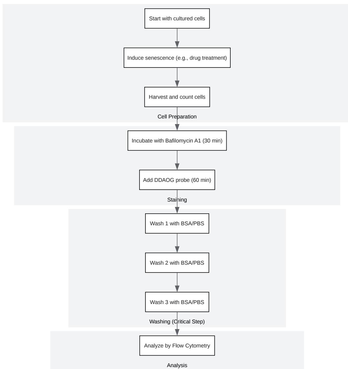
Experimental workflow for DDAO-based senescence detection.

Click to download full resolution via product page