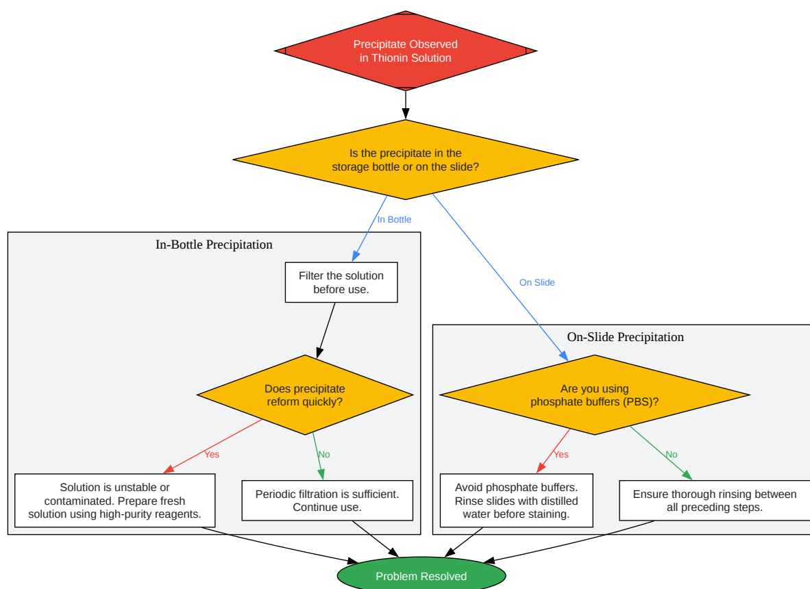
Diagram: Troubleshooting Thionin Precipitation

Click to download full resolution via product page