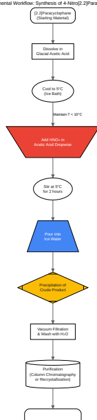
Experimental Workflow: Synthesis of 4-Nitro-2,2'-paracyclophane

Click to download full resolution via product page