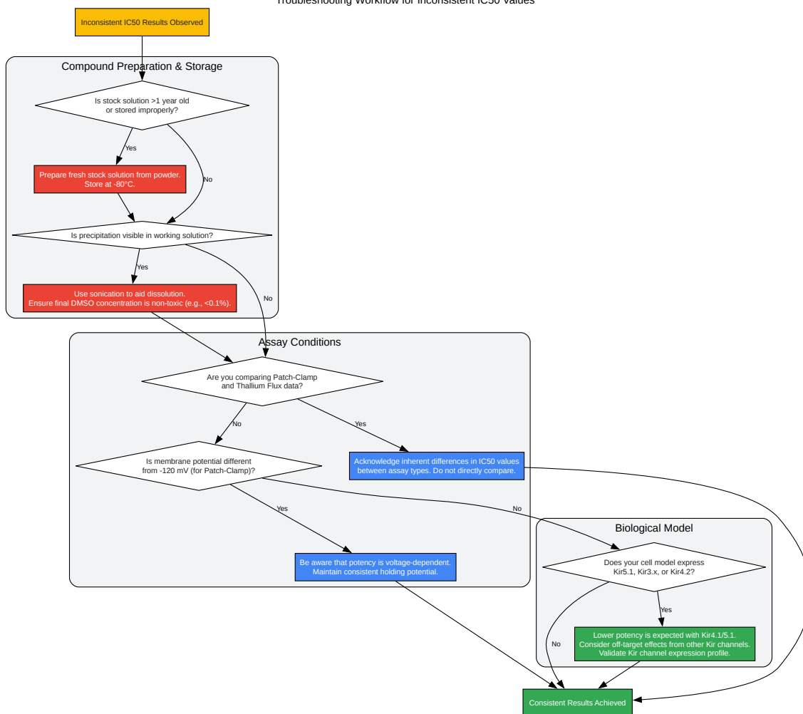
Troubleshooting Workflow for Inconsistent IC50 Values

Click to download full resolution via product page