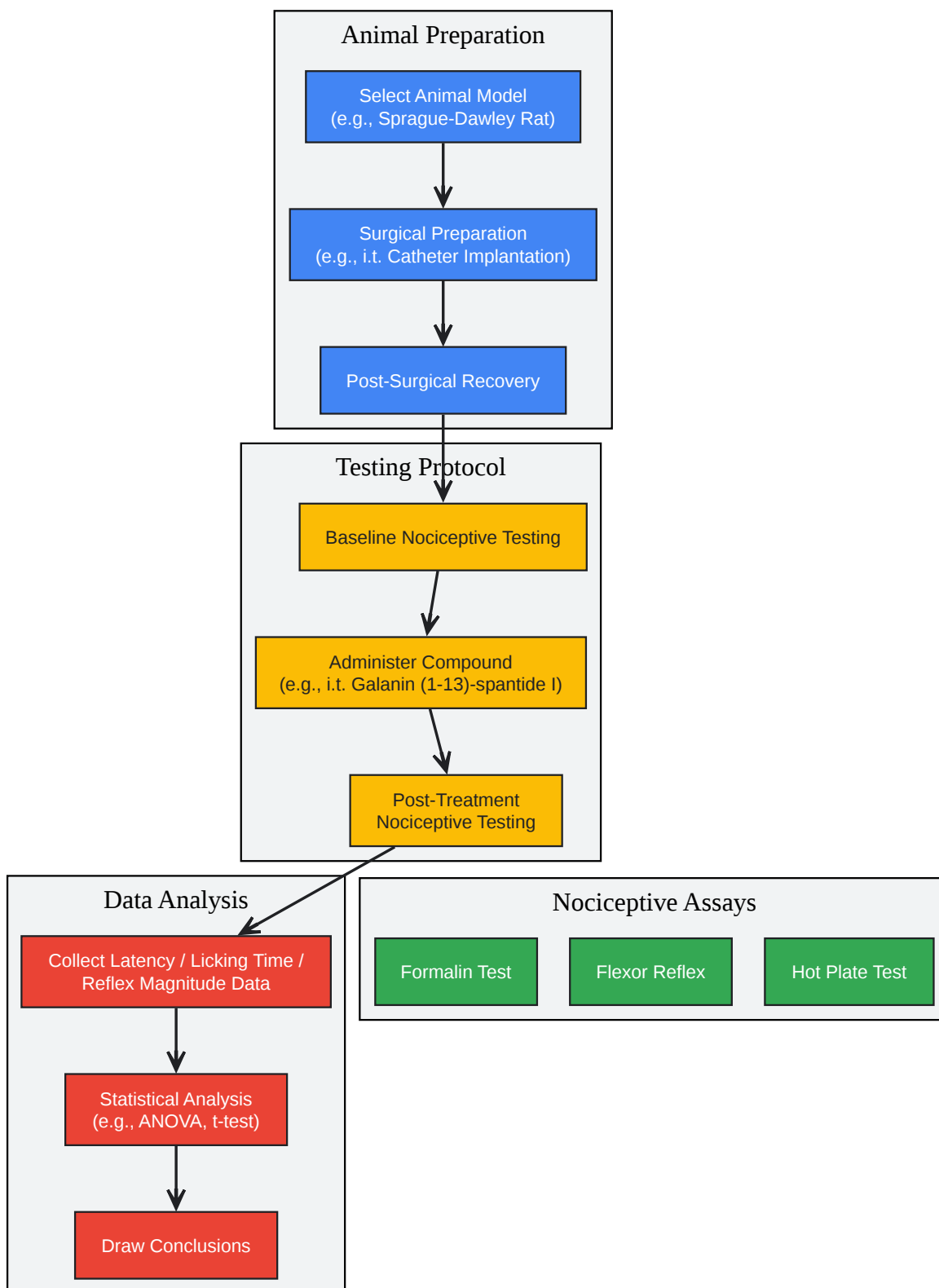
Diagram 3: Experimental Workflow for In Vivo Nociception Study