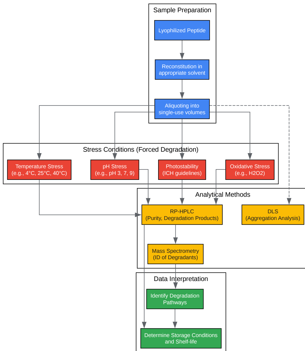
Experimental Workflow for Peptide Stability Assessment

Click to download full resolution via product page