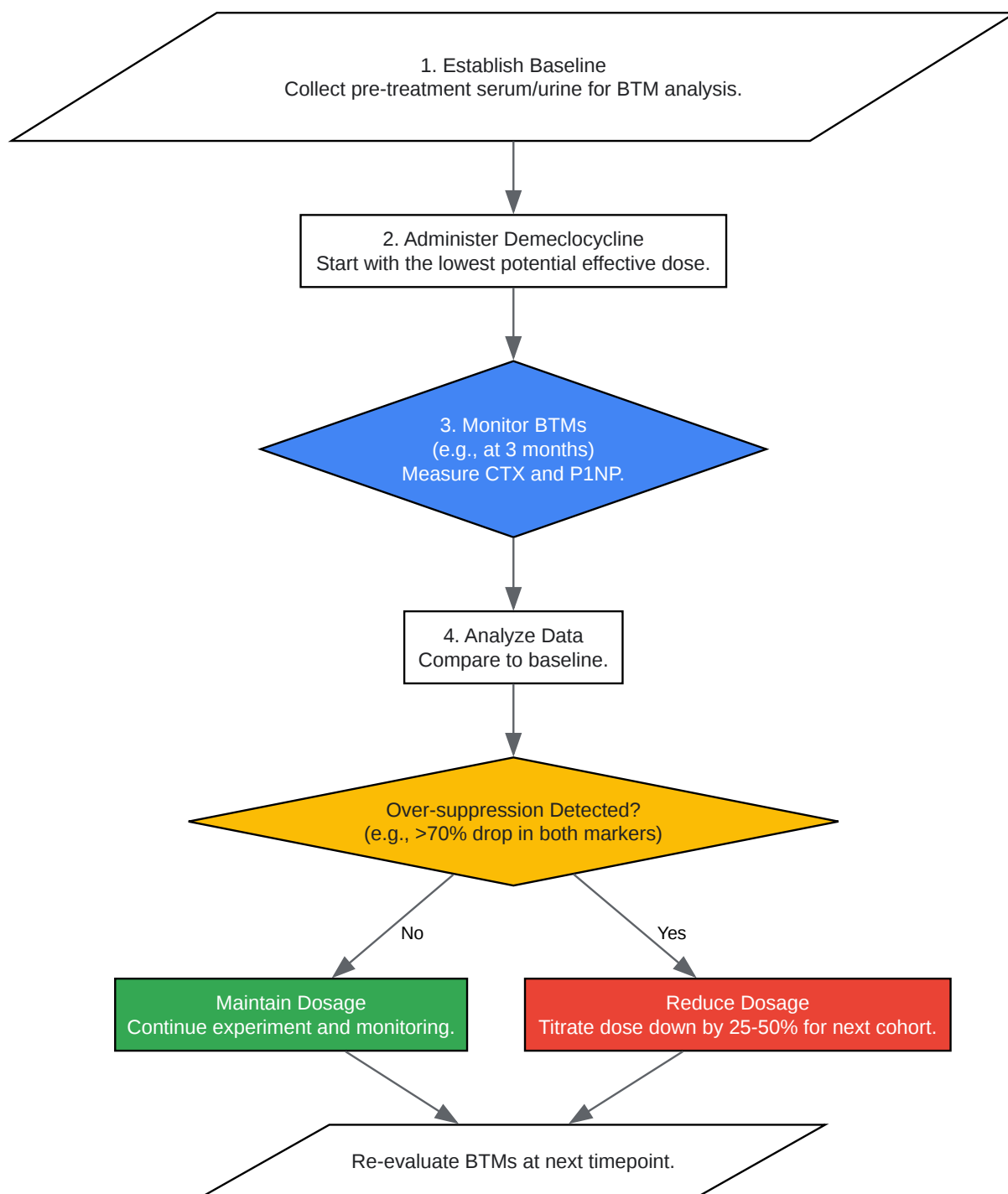
Fig 2. Workflow for Dosage Adjustment