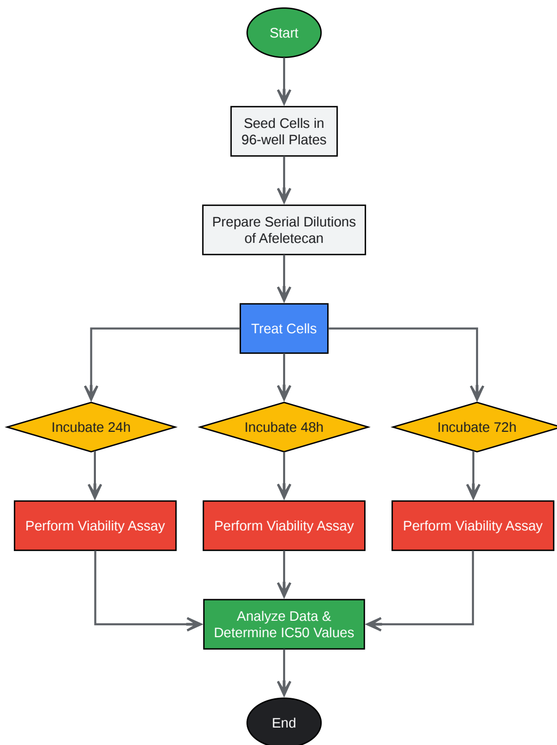
Workflow for Optimizing Afeletecan Exposure Time

Click to download full resolution via product page