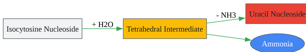
Figure 1: Hydrolytic Deamination of Isocytosine Nucleoside

Click to download full resolution via product page