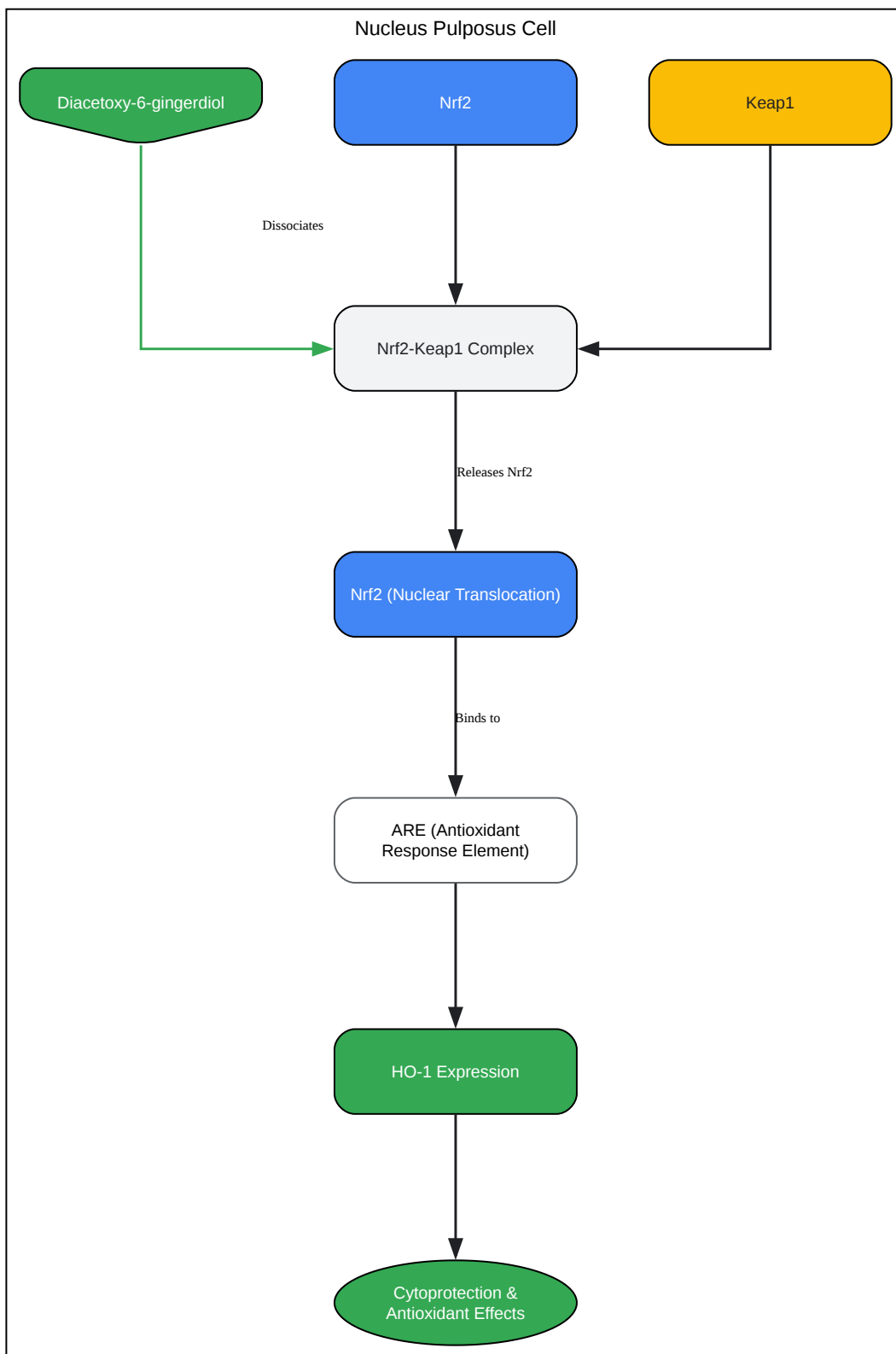
Caption: IL-1 \beta -mediated NLRP3 Inflammasome and Pyroptosis Pathway Inhibition by Diacetoxy-6-gingerdiol .