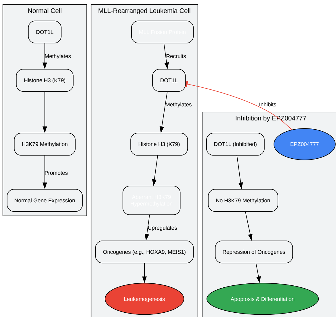
DOT1L Signaling Pathway and Inhibition by EPZ004777