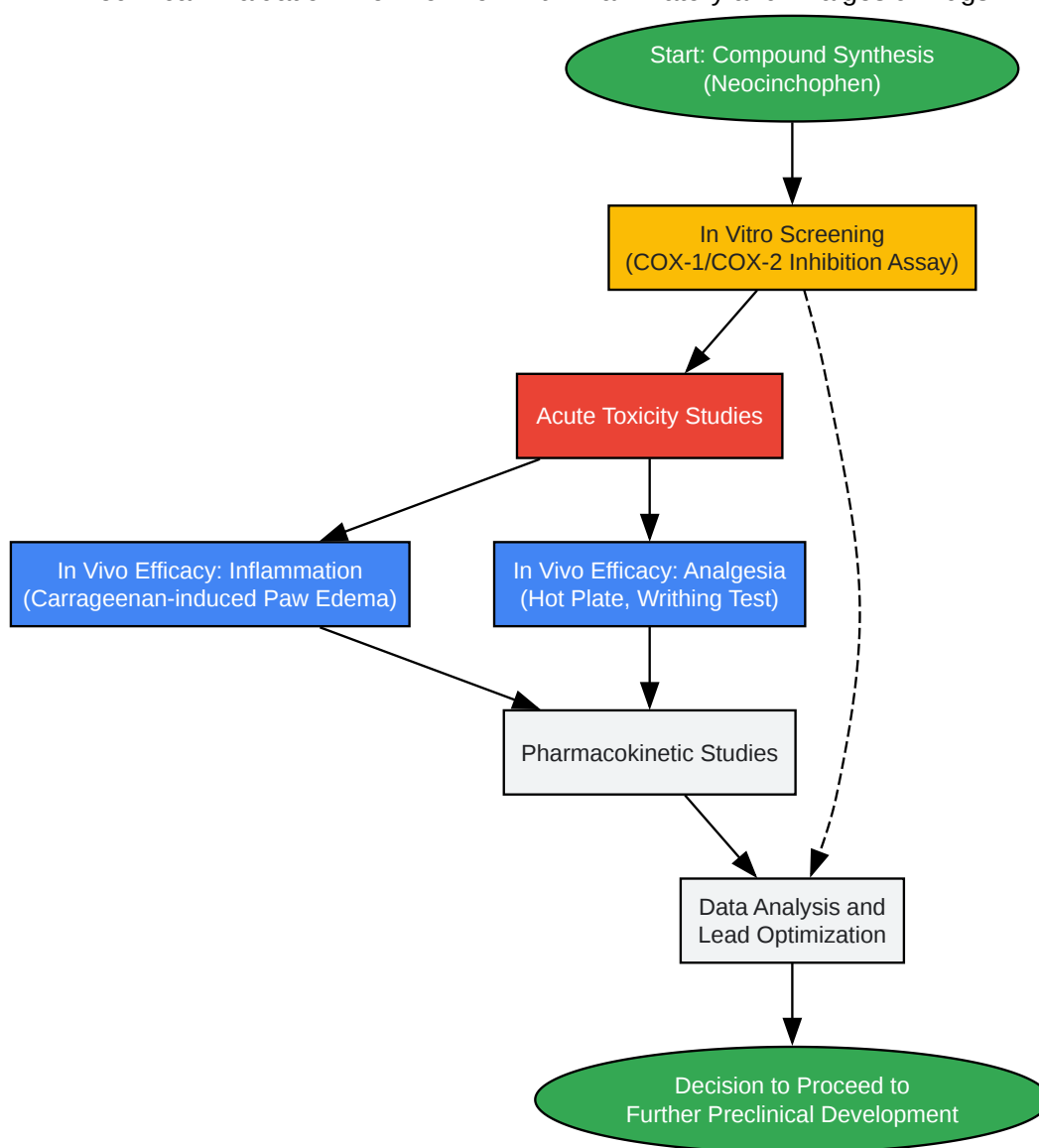
Preclinical Evaluation Workflow for Anti-Inflammatory and Analgesic Drugs

Click to download full resolution via product page