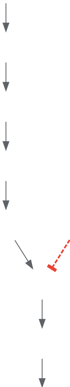
Figure 2. Inhibition of ERK Signaling

Click to download full resolution via product page