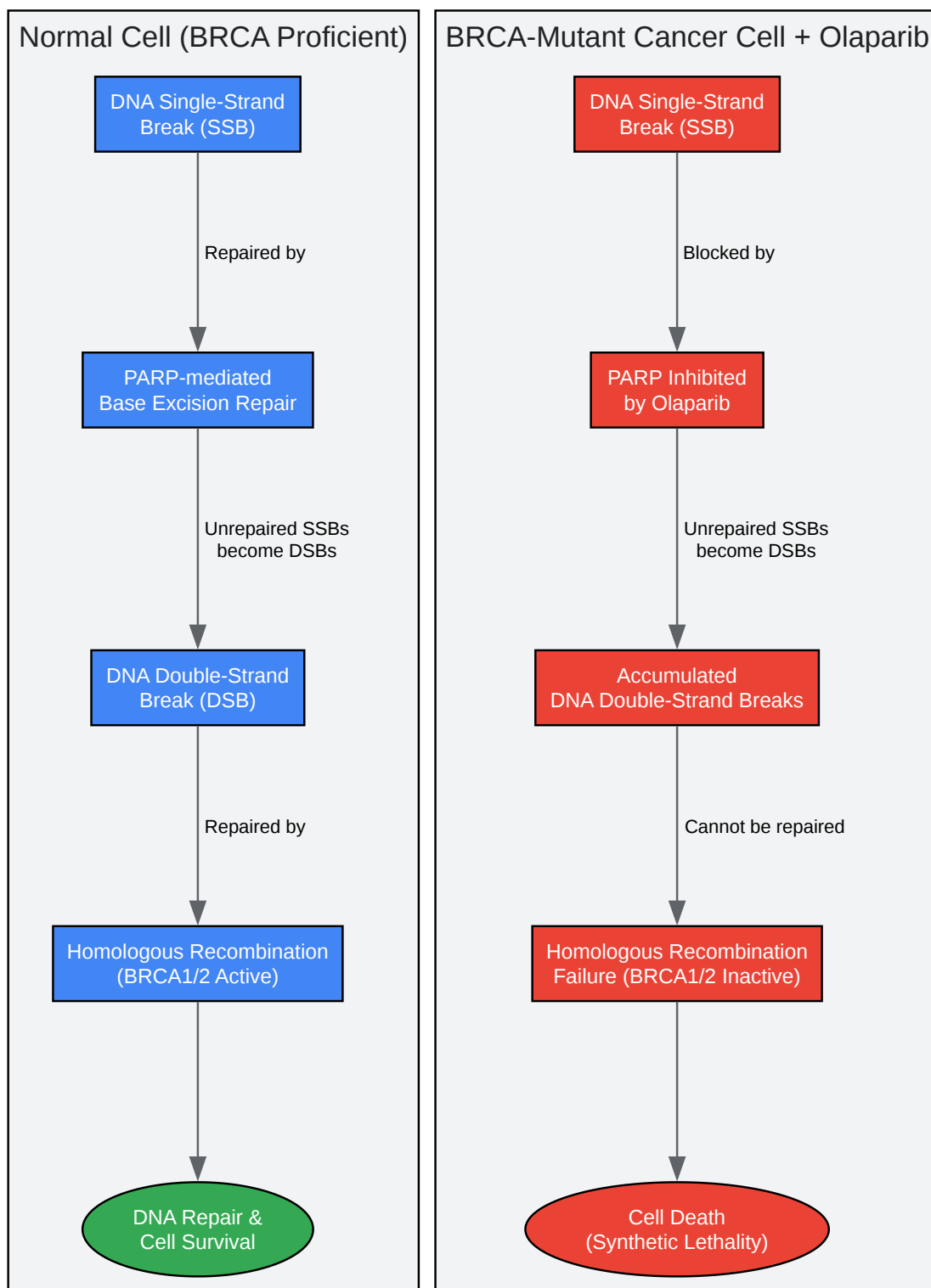
Mechanism of Synthetic Lethality with Olaparib in BRCA-Deficient Cells

Click to download full resolution via product page