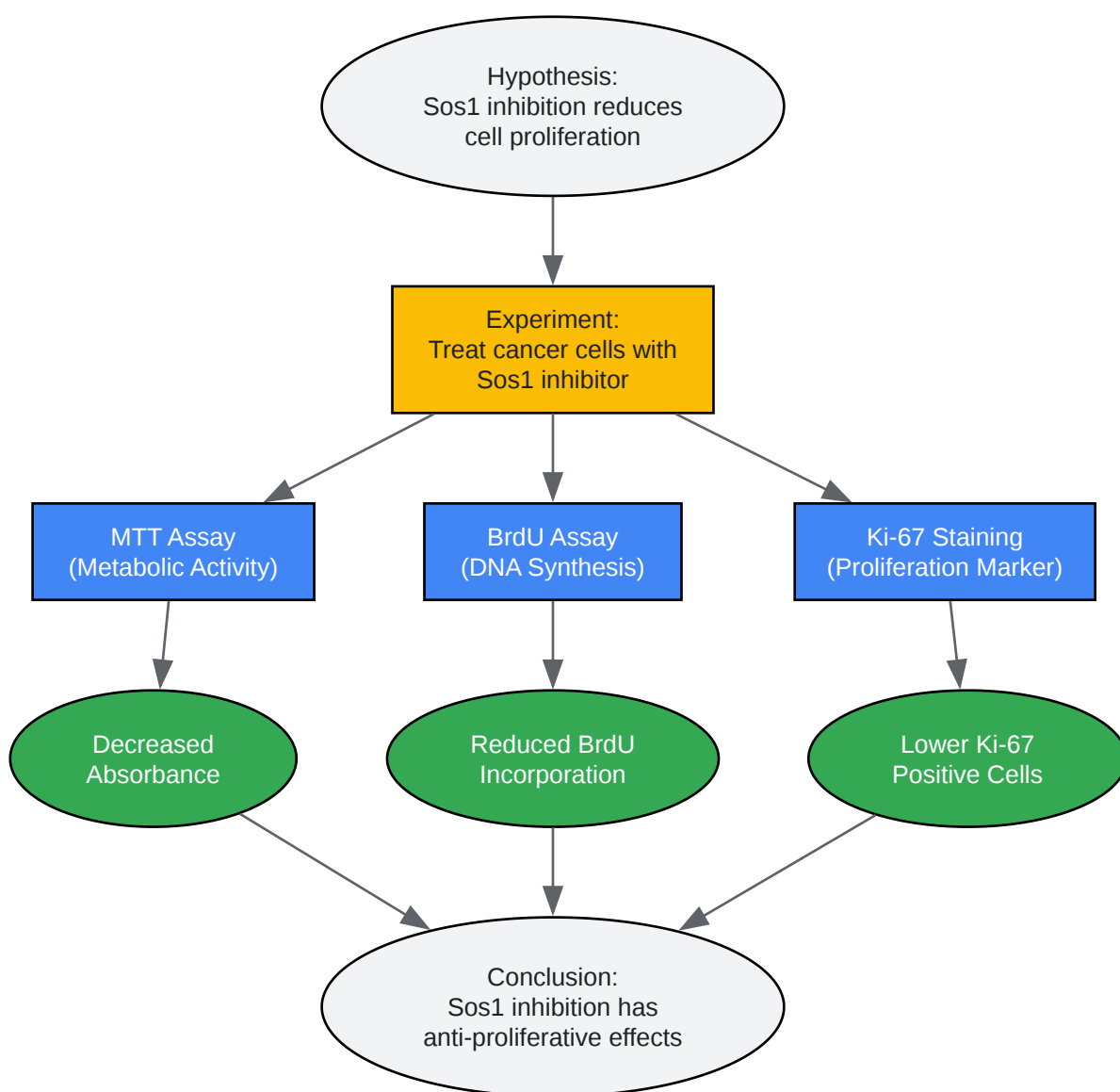
Caption: Workflow for the MTT cell proliferation assay.

Click to download full resolution via product page