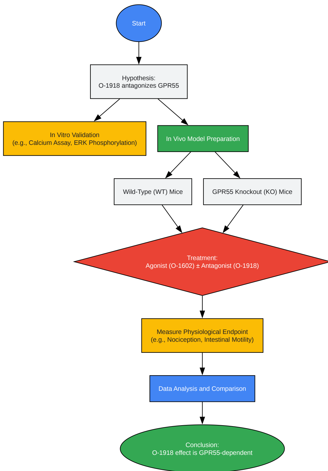
Caption: GPR55 Signaling Pathway

Workflow for Validating O-1918 with GPR55 Knockout Models