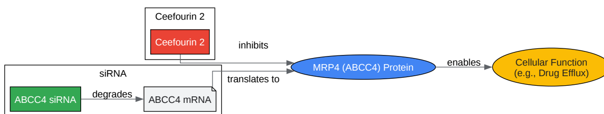
Caption: Workflow for validating the on-target effect of Ceefourin 2 .

Click to download full resolution via product page