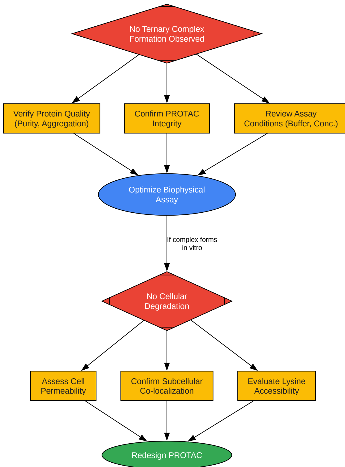
Caption: Mechanism of action for a VHL-recruiting PROTAC.

Click to download full resolution via product page