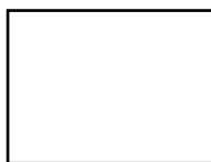
Chemical Structure of 3-Hydroxychimaphilin

Click to download full resolution via product page